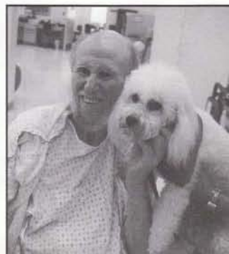
Lido stops by to visit a good friend.