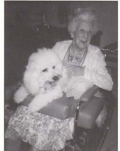
Sukoshi (an adult Bichon Frise whose name means "little one" in Japanese) has a special pillow to relax on when she comes to spend time with one of her friends at Integrated Health Services.

this community effort? Phone Pet Therapy at 366-2226.